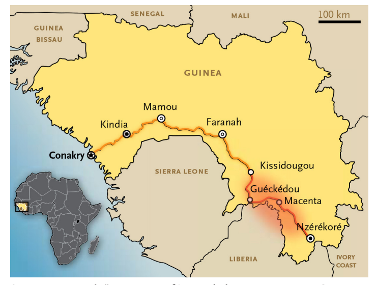
Figure 1. Map of Guinea Showing Initial Locations of the Outbreak of Ebola Virus Disease

Source: Baize et al. "Emergence of Zaire Ebola Virus Disease in Guinea — Preliminary Report". The New England Journal of Medicine, April 2014.