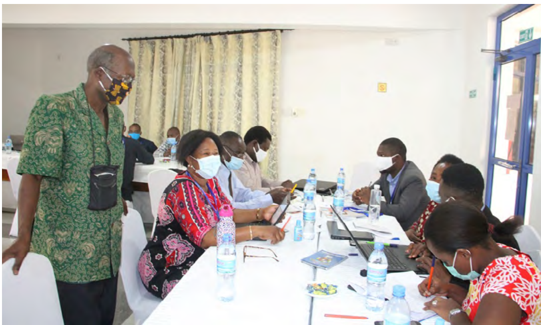
TZ 3: Focal Persons at the training engage in group work.

Personal protective equipment, distancing, and group size standards in this photo were consistent with local public health guidance and COVID-19 status in the specific country and time it was taken. This may not reflect best practices for all locations where COVID-19 is still spreading.