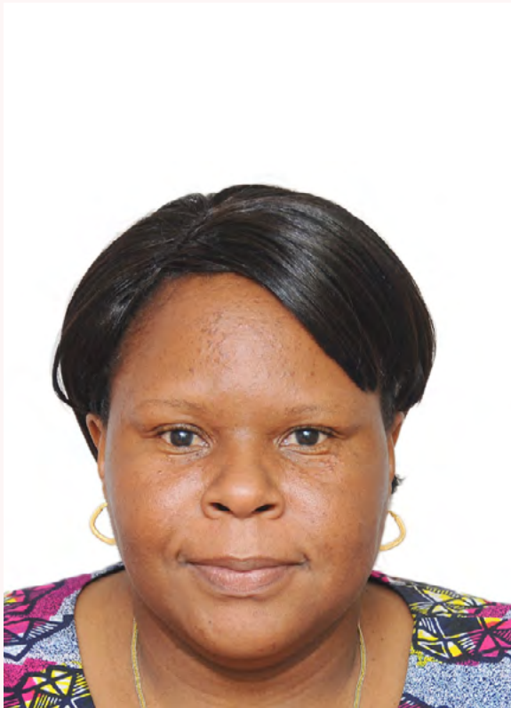
TZ 5

“Dialogue with professional bodies to discuss licensure and re-certification requirements for CEPD will facilitate standardization of their curricula and how to embed OH concepts into them. The discussions will ensure uniform criteria for scoring and relicensing professionals. CEPD harmonization will encourage organizations and government departments to enroll their professionals into University CEPD training programs to gain credits to practice or renew their licenses, thereby generating income for Universities.”