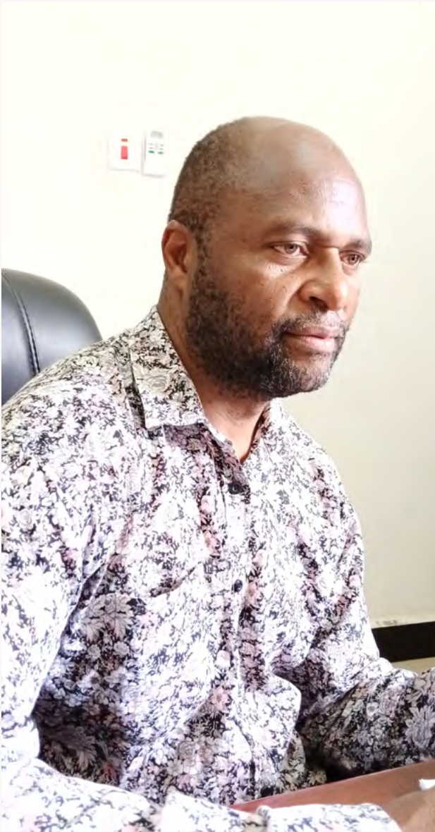
TZ 4:

“One Health capacity building among diploma and certificate level pre-service personnel is important because these are the first responders to any emergency in the community. They are the first contacts of human or animal with unusual disease symptoms and therefore critical for early detection, prevention and response to zoonotic disease threats.”