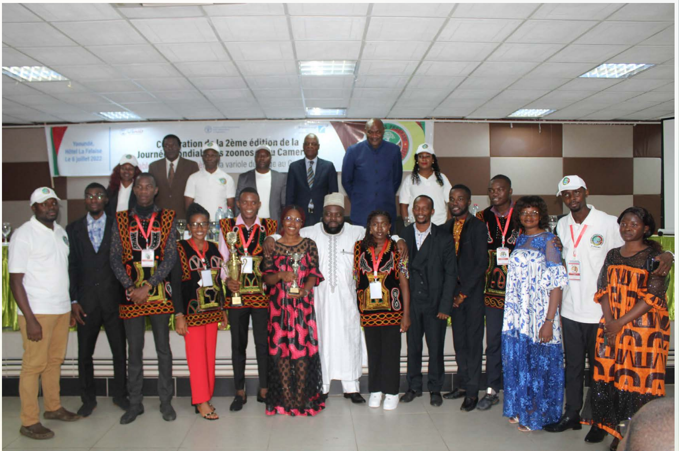
The second team of the GHCC 2022 in Cameroon, New Generation from Ngaoundere University, with the organizers of the competition.