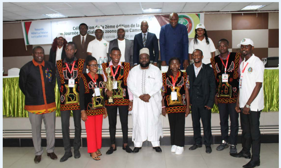
The winners of the GHCC 2022 in Cameroon, The Avengers of Université des Montagnes with the organizers of the competition

The GHCC provided both faculty and students an opportunity to work in multidisciplinary teams. The outbreak cases provided an occasion for students to apply theoretical knowledge to a real-life practical scenario, while also improving their knowledge about zoonoses prevention and control. Exposure to real experienced professionals encouraged students to generate innovative and viable solutions to the cases. Learning from this experience, many other One Health issues like AMR and food security can be addressed through such competitions.