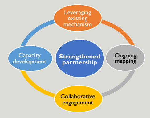
Diagram I: Sustaining partnerships and collaborations

United States Agency for International Development (USAID) through its convening power brings together partners under the EPT2 and GHSA mechanisms along with other implementing agencies. Under this arrangement, partners hold periodic consultative meetings and share work plans, progress and identify