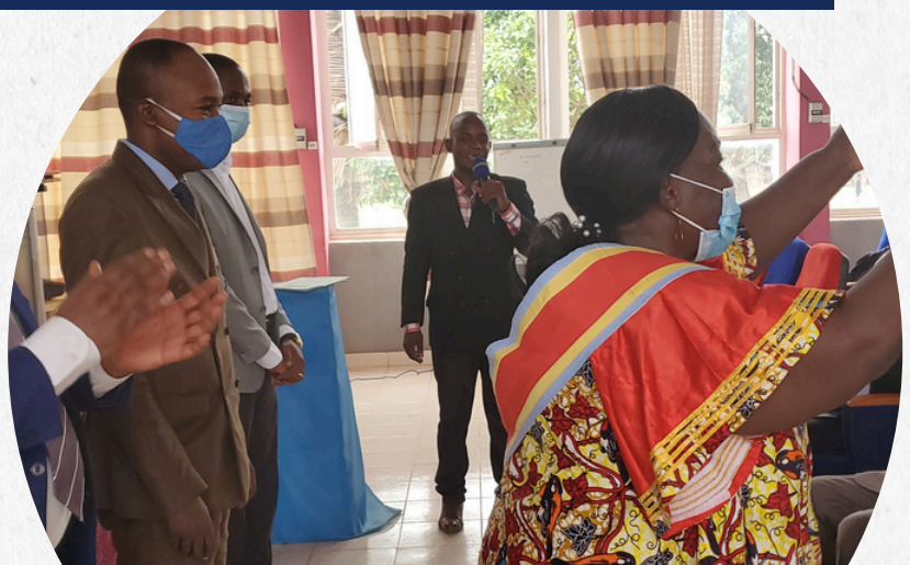
Territory administrator receiving her Certificat after training

To improve gender mainstreaming at KSPH, AFROHUN conducted a gender gap study which provided data for the development of a gender policy for the KSPH. This process was triggered by observations that there were few women taking up the MPH program as well as the scholarship opportunity that was offered through AFROHUN