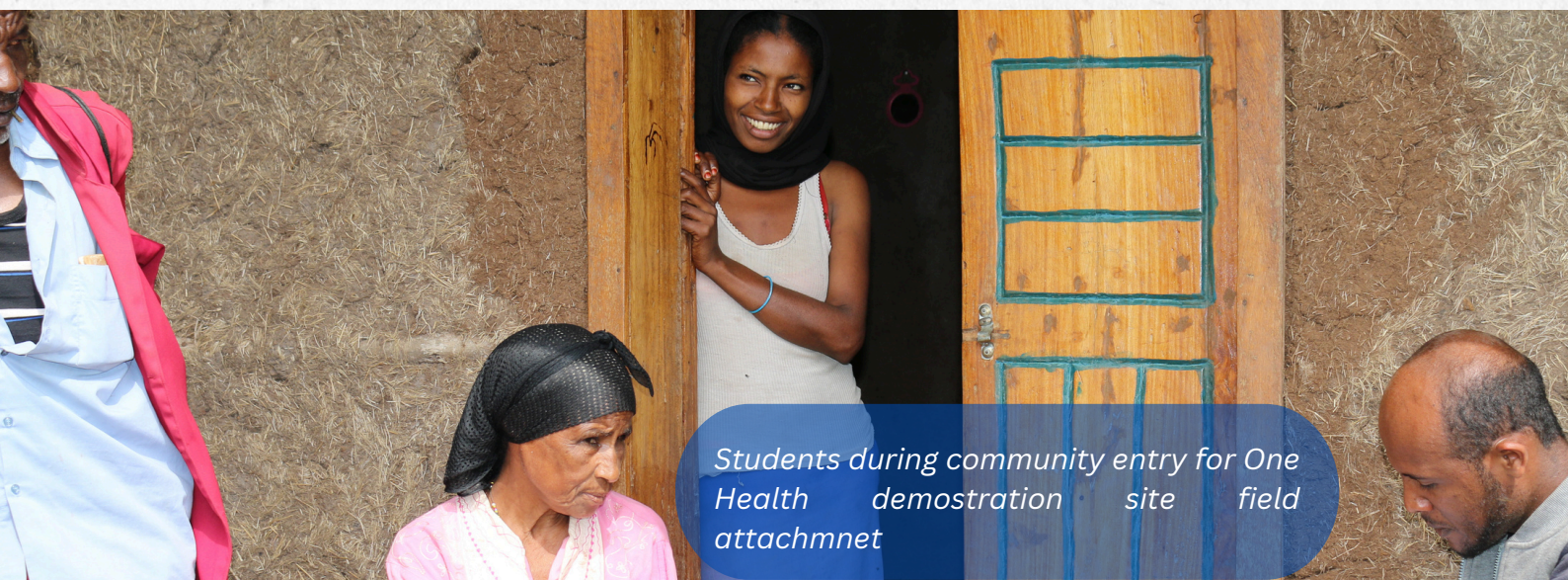
Students during community entry for One Health demonstration site field attachment

AFROHUN Ethiopia designed and implemented the research project 'Integrated Control of Rabies in Ethiopia: Determinant Factors Affecting Implementation of the National Strategy and Development of Platform for Rabies Information Management for Ethiopia (PRIME)'. This initiative involved faculty fellowships, student internships, and collaboration with three member universities, FAO, the Ministry of Health, and the Ministry of Agriculture, aiming to strengthen rabies control and information management systems. As a result of this study, an online platform, PRIME was developed to strengthen dog management in the country.