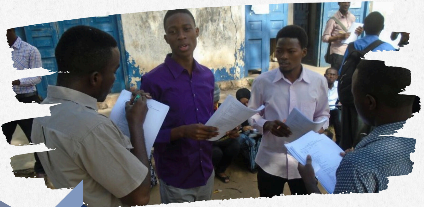
A group of students going through their data collection tools during a communicable diseases course field training in Kilosa district.

AFROHUN Tanzania supports Student One Health Innovation Clubs in 9 public and private universities across Tanzania to raise awareness about emerging and re-emerging infectious diseases particularly zoonotic, One Health approach to complex health threats, environmental sanitation and Antimicrobial Resistance (AMR).